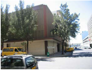
The brown field site before construction.